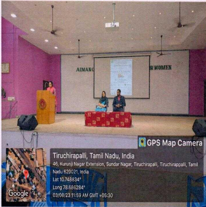
1. Welcome Address