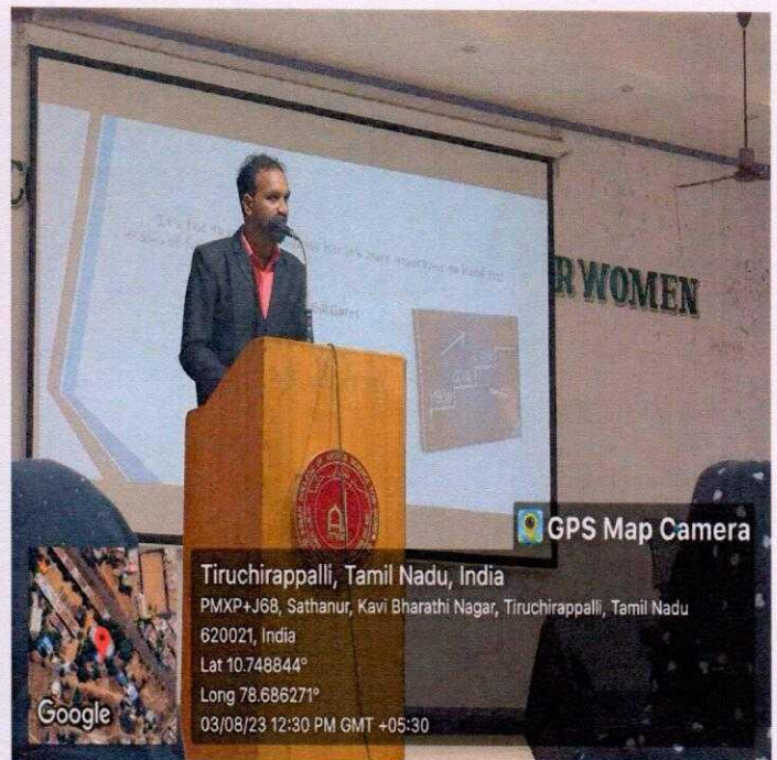
2. Chief Guest Address