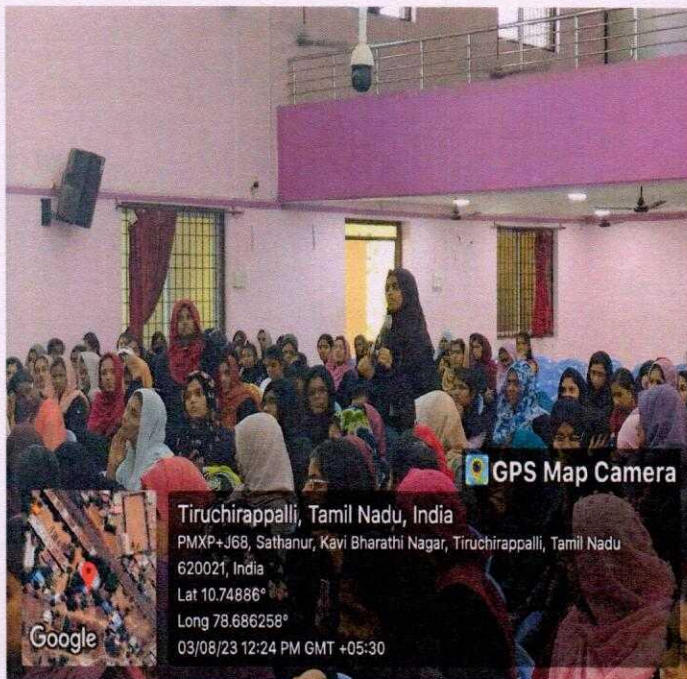
3. Students Feedback